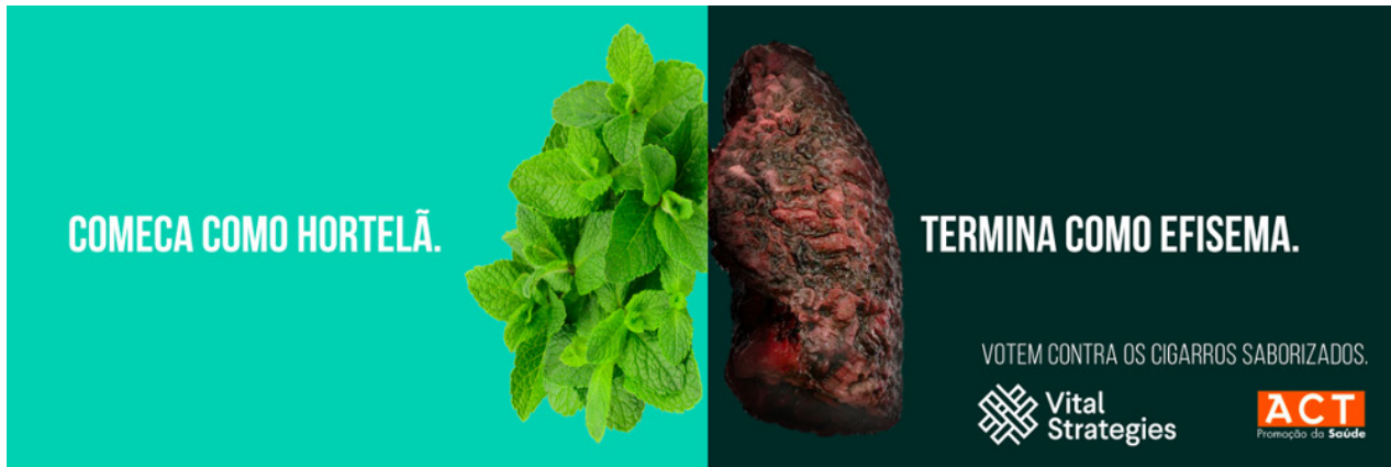
"It starts with mint and ends with emphysema."

This case study is part of a series highlighting our work with the Bloomberg Initiative to Reduce Tobacco Use in priority countries.